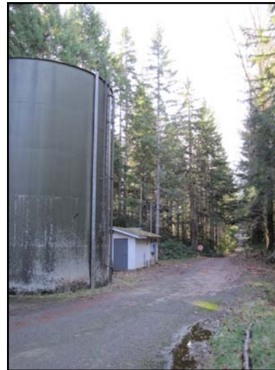
Alderbrook Well House 1 and Reservoir 1