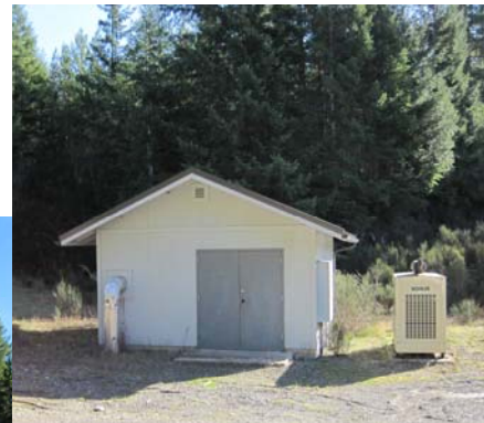
Alderbrook Booster Station & Reservoir 3