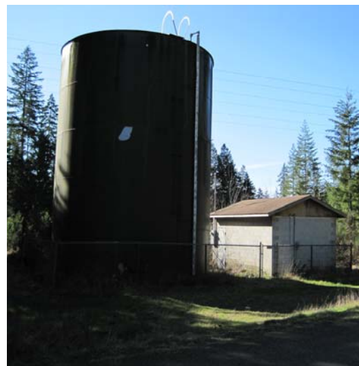
Alderbrook Well House 2 & Reservoir 2

Inorganic Contaminants: 1 sample every 9 years; Synthetic Organic Contaminants (herbicides): 1 sample every 9 years; Synthetic Organic Contaminants (pesticides): no samples through December 2016 (Wells 1 & 3), 1 sample every 9 years (Well 2); Volatile Organic Contaminants (Wells 1 & 3): 1 sample every 6 years; Soil Fumigants: no samples through December 2016; Dioxin, Diquat, Endothal, Glyphosphate, Insecticides: complete waivers.