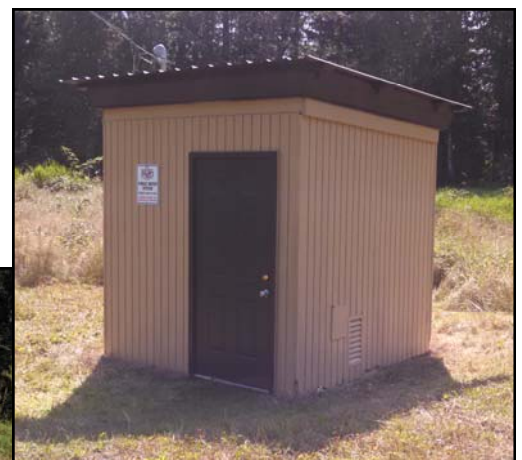
Lake Arrowhead Well House Top—After new paint Left—Before new paint