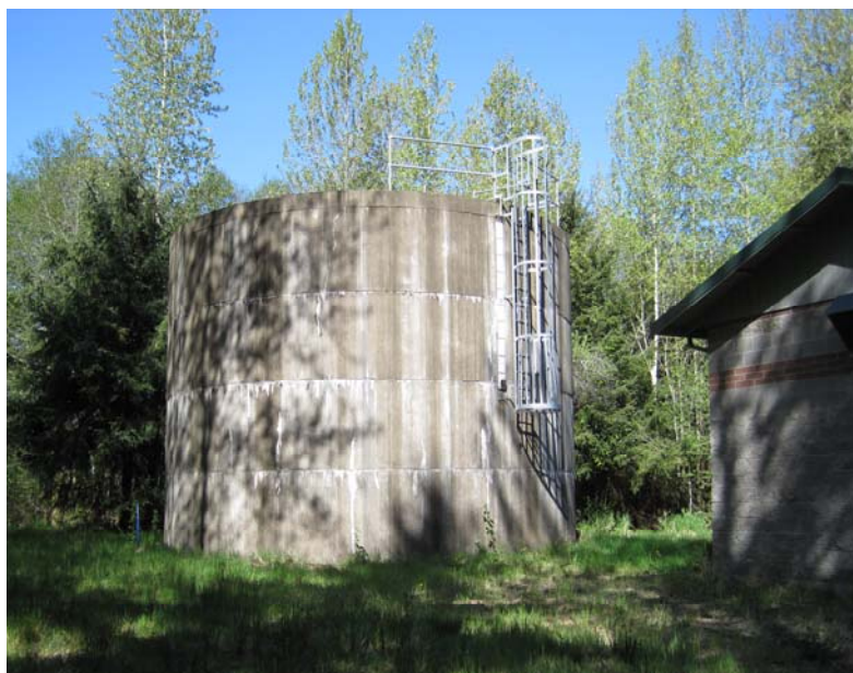
Lake Arrowhead Reservoir

Haloacetic Acids: Some people who drink water containing haloacetic acids in excess of the MCL over many years may have an increased risk of getting cancer.