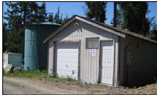
Tiger Lake Terrace Tracts Pump House Above —before new paint Below—after new paint

This system is treated for corrosion control. When water is too acidic, it can cause copper and lead to leach from water pipes and plumbing fixtures. Treatment includes UV-treated air and carbon dioxide aerating the water before the water enters the distribution system to reduce the acidity. With