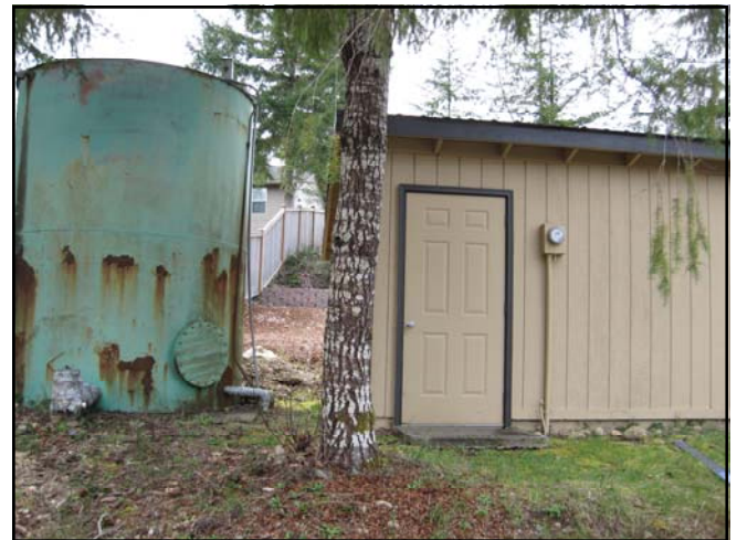
Union Ridge Reservoir and Booster Station