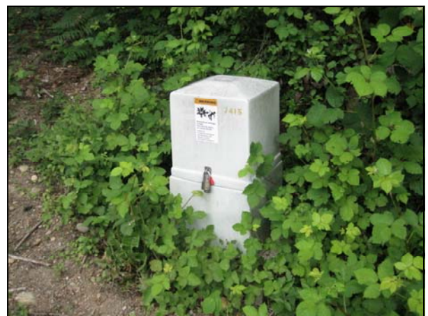
Well 2 Enclosure

Iron: Iron is known to occur naturally in well water due to the type of rock a well may be drilled into. Concentrations above the national guidelines may contribute to problems with taste, odor and color of the water coming out of your tap. The District monitors the levels of iron in the well water and the number of complaints about water quality. Iron concentrations have dropped drastically from 1,000 ppb (Year 2010) to 50 ppb (Year 2016).