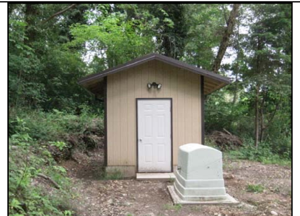
New View Ridge Heights Pump House and Well 1