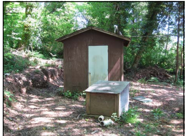
Old View Ridge Heights Pump House and Well 1