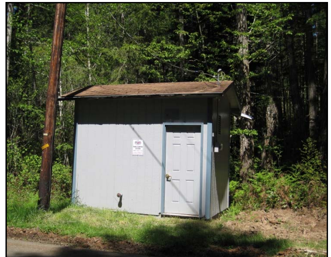
Viewcrest Beach Well House