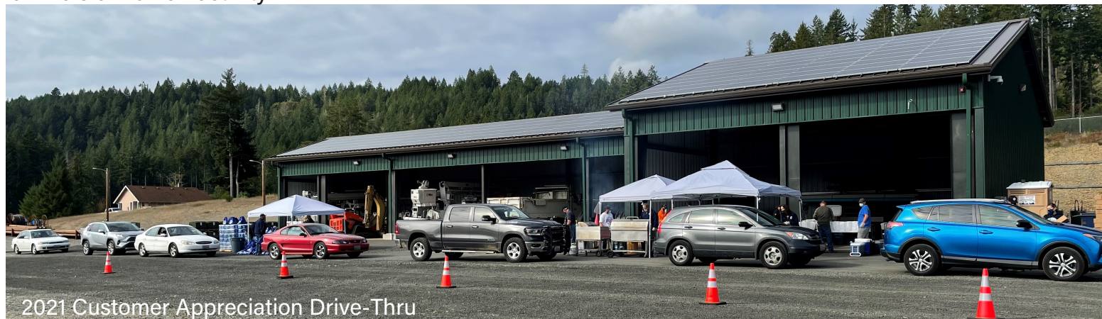
2021 Customer Appreciation Drive-Thru

The sources of drinking water (both tap and bottled) include rivers, lakes, streams, ponds, reservoirs, springs and wells. As water travels over the surface of the land or through the ground, it dissolves naturally occurring minerals, in some cases, radioactive material, and can pick up substances resulting from the presence of animals or human activity.