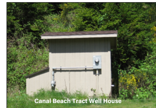
Canal Beach Tract Well House

The State Dept. of Health has Source Water Assessment Program (SWAP) data available online at: https://fortress.wa.gov/doh/swap/ which lists potential contamination for each Group A water source in the state. This is an interactive map.