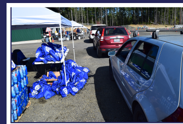
Customers lining up for swag and food.