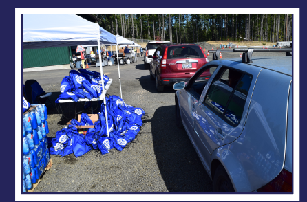
Customers lining up for swag and food.