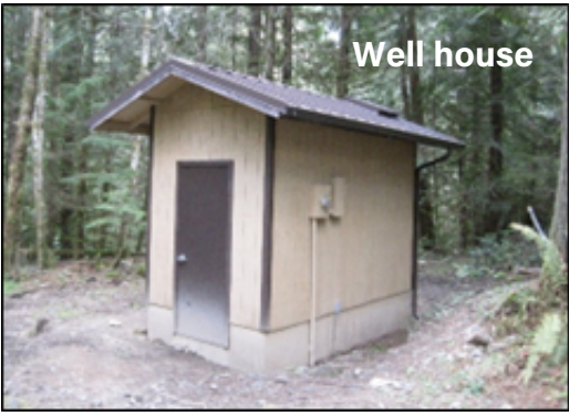
A water source in the state. This is an interactive map

Water Assessment Program (SWAP) fortress.wa.gov/doh/swap/ which lists potential contamination for each Group