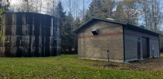
Reservoir and Booster Station