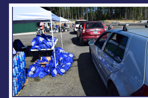
Customers lining up for swag and food.

Water Use Efficiency (WUE) Goal: a set target for water usage approved by the Board of Commissioners through the public process.