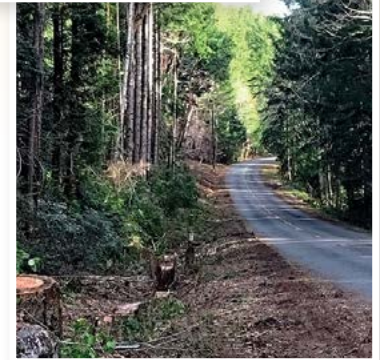
Rebuild work on Bee Mill Rd.

You may have noticed that your recent bill has a new look! We've been working over the last several months to create a new bill format that's easy to read and still give our customers all of the important information they need to see. The new format gives us more room to provide important information in the messaging center, and even allows us the opportunity to include marketing images like energy saving rebates that are available, Canal Comfort Fund donation drives, and the Go Paperless campaign, among others. We are excited to hear from you and what you think of the new look!