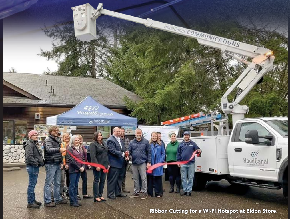
Ribbon Cutting for a Wi-Fi Hotspot at Eldon Store.

In other good news, HCC also received grants from the Washington State Broadband Office and National Telecommunications and Information Administration (NTIA) to