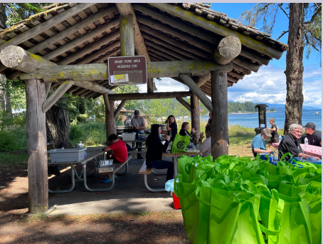
Annual Company Picnic

In the water quality table you will find many terms and abbreviations you might not be familiar with. To help you better understand these terms, we have provided the following definitions: