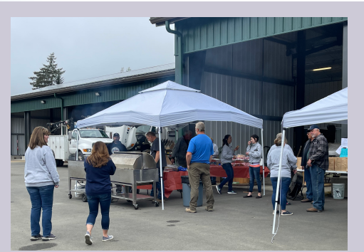
PUD NO.1 Employees getting ready for the Customer Appreciation Drive-Thru BBQ!

The sources of drinking water (both tap and bottled) include rivers, lakes, streams, ponds, reservoirs, springs and wells. As water travels over the surface of the land or through the ground, it dissolves naturally occurring minerals, in some cases, radioactive material, and can pick up substances resulting from the presence of animals or human activity.