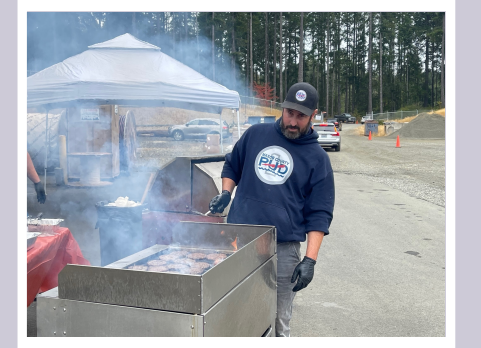
Booster, Lead Water Operato