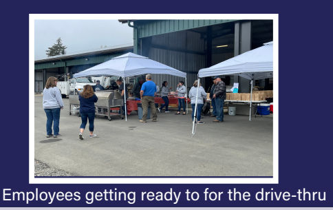
Customer Appreciation Drive-Thru October 2022

Water Use Efficiency (WUE) Goal: a set target for water usage approved by the Board of Commissioners through the public process.