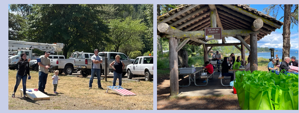
Annual Company Picnic

In the water quality table you will find many terms and abbreviations you might not be familiar with. To help you better understand these terms, we have provided the following definitions: Action Level (AL) - The concentration of a contaminant which, if exceeded, triggers treatment or other requirements which a water system must follow.