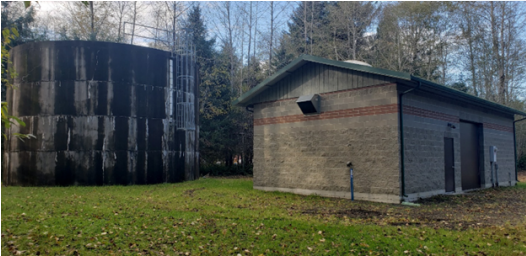
Reservoir and Booster Station

Treatment Technique (TT) - a required process intended to reduce the level of a contaminant in drinking water. < - Means 'less than'