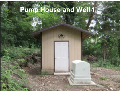
Pump House and Well 1