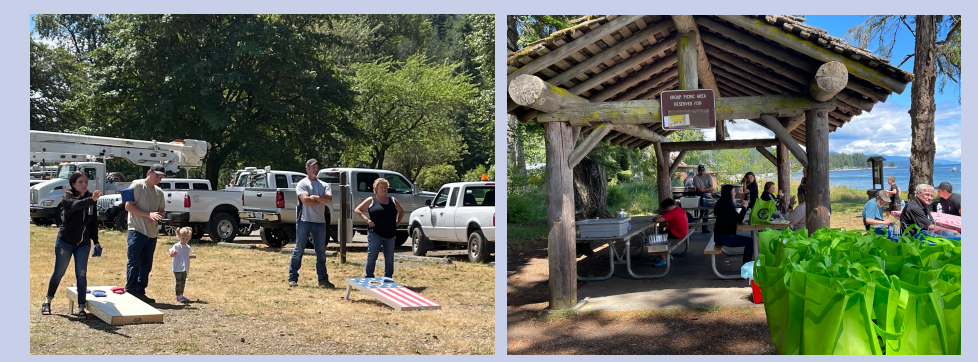
Annual Company Picnic

In the water quality table you will find many terms and abbreviations you might not be familiar with. To help you better understand these terms, we have provided the following definitions: Action Level (AL) - The concentration of a contaminant which, if exceeded, triggers treatment or other requirements which a water system must follow.