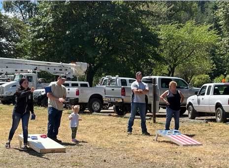
Annual Company Picnic