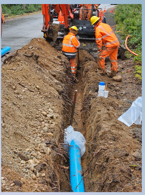
Installing new water line on E Westwood Ln W

To help reduce potential exposure to lead: for any drinking water tap that has not been used for 6 hours or more, flush water for thirty (30) seconds to two (2) minutes through the tap until the water is noticeably colder before using for drinking or cooking. You can use the flushed water for watering plants, washing dishes or general cleaning. Only use water from the cold-water tap for drinking, cooking, and especially for making baby formula. Hot water is likely to contain higher levels of lead. If you are concerned about lead in your water, you may wish to have your water tested. Information on lead in drinking water is available from EPA's Safe Drinking Water Hotline at 1-800-426-4791 or online at http://www.epa.gov/safewater/lead.