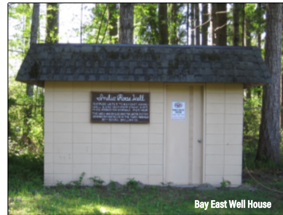
Bay East Well House

The State Dept. of Health has Source Water Assessment Program (SWAP) data available online at: https://fortress.wa.gov/doh/swap/ which lists potential contamination for each Group A water source in the state. This is an interactive map.