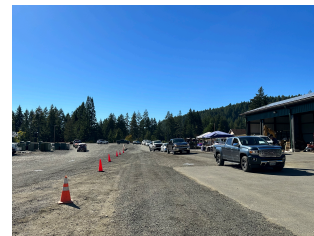
Customers taking part in the drive-thru

In the water quality table you will find many terms and abbreviations you might not be familiar with. To help you better understand these terms, we have provided the following definitions: