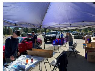
Customers receiving goodies and food