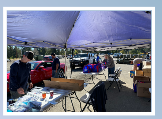
PUD NO. 1 Employees working hard at the Customer Appreciation Drive-Thru BBQ!

To help reduce potential exposure to lead: for any drinking water tap that has not been used for 6 hours or more, flush water for thirty (30) seconds to two (2) minutes through the tap until the water is noticeably colder before using for drinking or cooking. You can use the flushed water for watering plants, washing dishes or general cleaning. Only use water from the cold-water tap for drinking, cooking, and especially for making baby formula. Hot water is likely to contain higher levels of lead. If you are concerned about lead in your water, you may wish to have your water tested. Information on lead in drinking water is available from EPA's Safe Drinking Water Hotline at 1-800-426-4791 or online at http://www.epa.gov/safewater/lead.