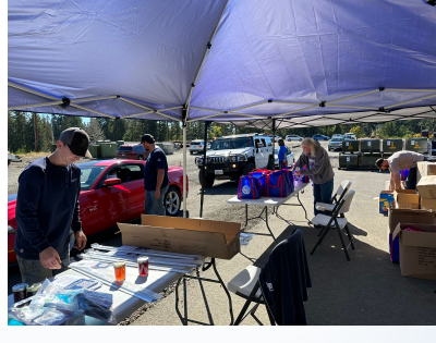
PUD employees ready to hand out goodies