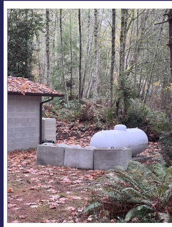
Propane tank and Generator