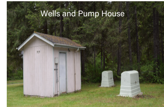
Wells and Pump House

approved for 68 connections; there are currently 59 connections. Well 2 pump was replaced. A Water System Plan is available from our office that provides more information about the Dayton Trails Water System. Our wells has been rated by the Washington State Department of Health as moderate risk or susceptibility for contamination. More information regarding this rating can be obtained by contacting PUD No. The State Dept. of Health has Source Water Assessment Program (SWAP) data available online at: https://fortress.wa.gov/doh/swap/