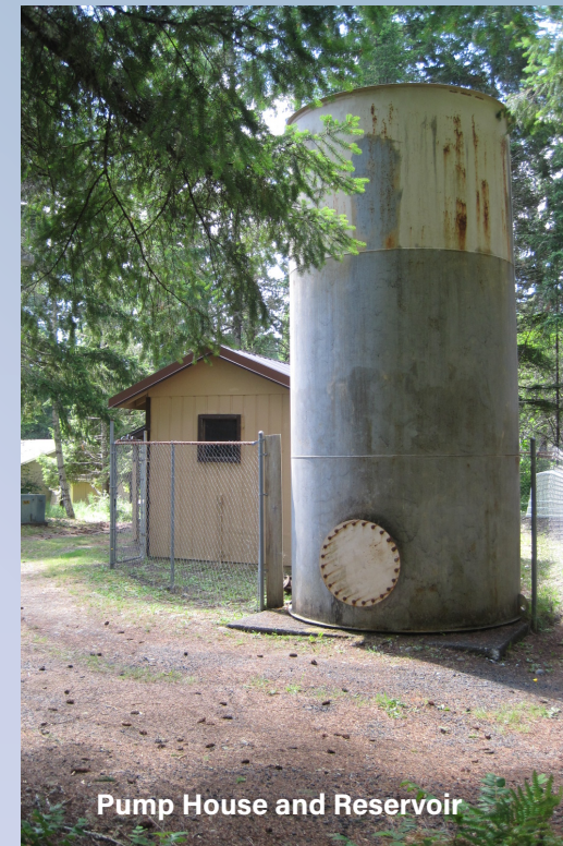
Pump House and Reservoir

To ensure that tap water is safe to drink, the Washington State Board of Health and/or EPA