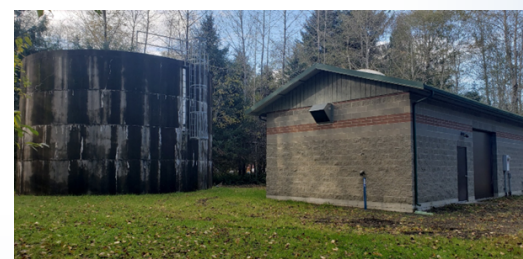
Reservoir and Booster Station