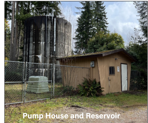
Pump House and Reservoir

A Water System Plan is available from our office that provides more information about the Lakewood Heights System. Our well has been rated by the Washington State Department of Health as low for risk or susceptibility to contamination. More information regarding this rating can be obtained by contacting PUD No. 1. The State Dept. of Health has Source Water Assessment Program (SWAP) data available online at: https://fortress.wa.gov/doh/swap/ which lists potential contamination for each Group A water source in the state. This is an interactive map.