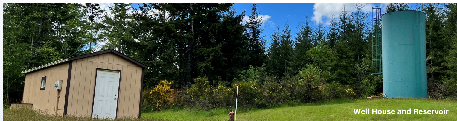
Well House and Reservoir

The sources of drinking water (both tap and bottled) include rivers, lakes, streams, ponds, reservoirs, springs and wells. As water travels over the surface of the land or through the ground, it dissolves naturally occurring minerals, in some cases, radioactive material, and can pick up substances resulting from the presence of animals or human activity.