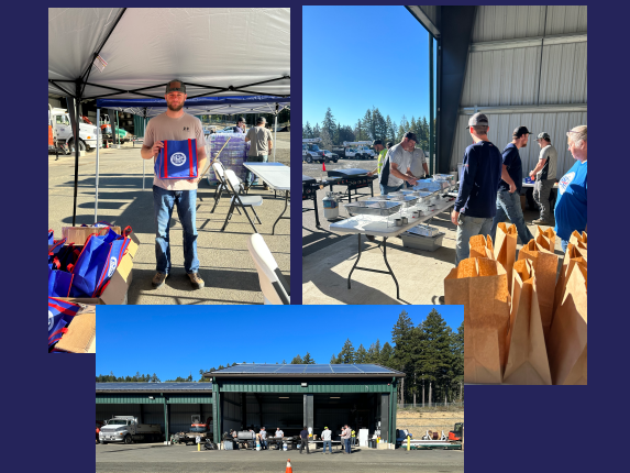
Employees getting ready for Customer Appreciation 2023