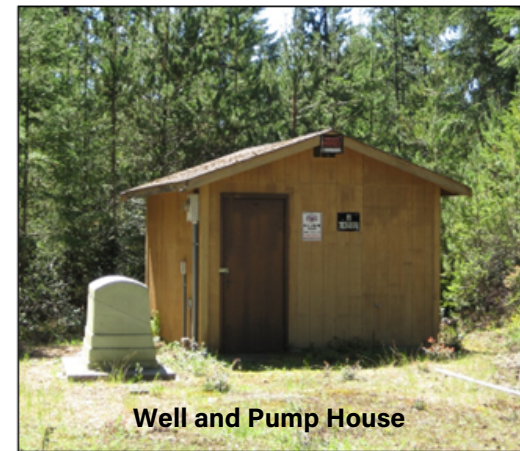
Well and Pump House

about the Twanoh Terrace Water System. Our well has been rated by the Washington State Department of Health as moderate for risk or susceptibility to contamination. More information regarding this rating can be obtained by contacting PUD No. 1. The State Dept. of Health has Source Water Assessment Program (SWAP) data available online at: https://fortress.wa.gov/doh/swap/ which lists potential contamination for each Group A water source in the state. This is an interactive map.