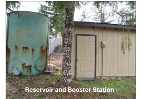
Reservoir and Booster Station

The State Dept. of Health has Source Water Assessment Program (SWAP)