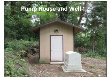
Pump House and Well 1

and serves customers on Fir Lane on the west side of Belfair Tahuya Road. All water services and sources are metered. The system is approved for 139 connections; there are currently 111 connections. In July the routine water sample came back unsatisfactory and the water system was chlorinated. August water sample was satisfactory. Our wells have been rated by the Washington State Department of Health as moderate for Well 1 and high for Well 2 for risk or susceptibility to contamination. More information regarding this rating can be obtained by contacting PUD No. 1.