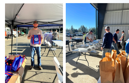
Employees getting ready for Customer Appreciation 2023