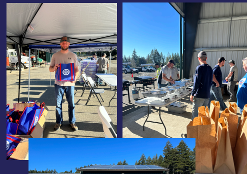
Employees getting ready for Customer Appreciation 2023

malfunctioning meters or meter reading errors. The volume difference of total water produced and authorized consumption (TP-AC). Percent DSL= [(TP-AC)/TP] \times 100\% Total Water Produced (TP): volume of water pumped from a well, diverted from a surface water or purchased from another system.