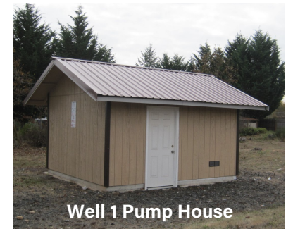
Well 1 Pump House

well 1 was removed and bladder tanks were installed in 2021. The system is approved for 65 connections and there are currently 64 connections on the water system. A Water System Plan is available from our office that provides more information about the Woodland Manor Water System. Our wells has been rated by the Washington State Department of Health as moderate risk for susceptibility for contamination. More information regarding this rating can be obtained by contacting PUD No. 1. The State Dept. of Health has Source Water Assessment Program (SWAP)