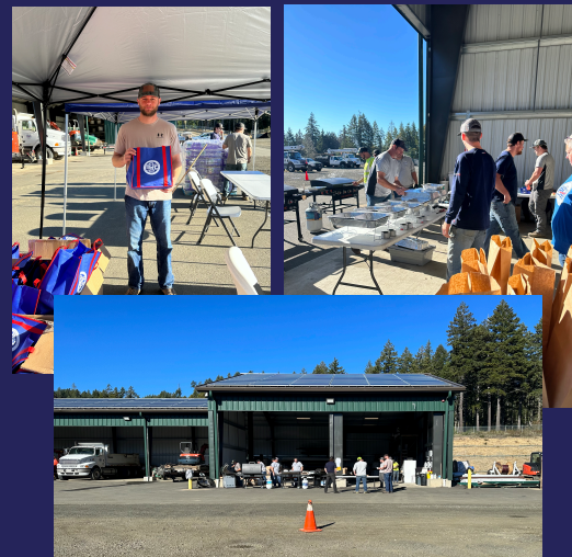
Employees getting ready for Customer Appreciation 2023