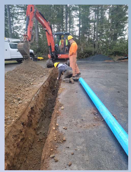
Installing new water line on E Dogwood Ct