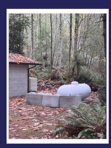
Propane tank and Generator