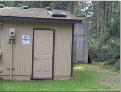
Well house and Reservoir

To ensure that tap water is safe to drink, the Washington State Board of Health and/or EPA