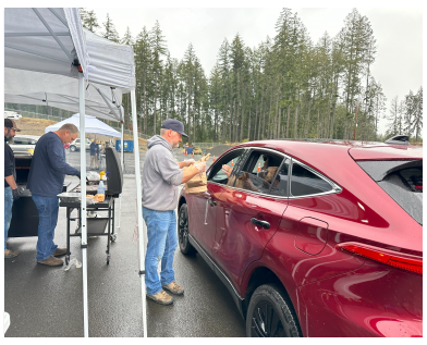
Customer Appreciation 2024

To ensure that tap water is safe to drink, the Washington State Board of Health and/or EPA prescribe regulations that limit the amount of certain contaminants in water provided by public water systems. The Food and Drug Administration (FDA) and the Washington Department of Agriculture regulations establish limits for contaminants in bottled water that must provide the same protection for public health.