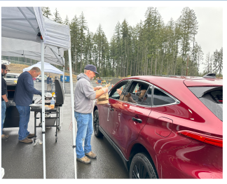
Customer Appreciation 2024

To ensure that tap water is safe to drink, the Washington State Board of Health and/or EPA prescribe regulations that limit the amount of certain contaminants in water provided by public water systems. The Food and Drug Administration (FDA)