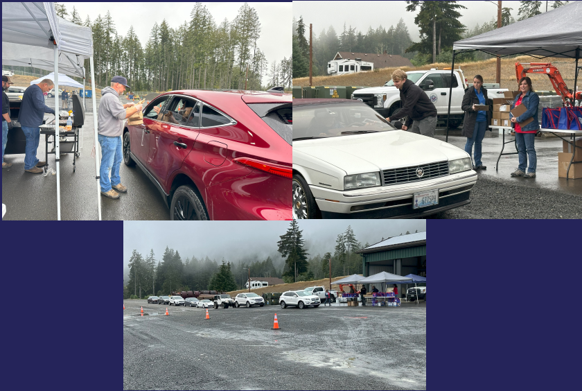
Employees getting ready for Customer Appreciation 2024

Authorized Consumption (AC): volume of water used by consumers as shown through meter readings, fire-fighting, system flushing, tank cleaning and street cleaning.