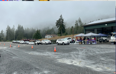
Customer Appreciation 2024