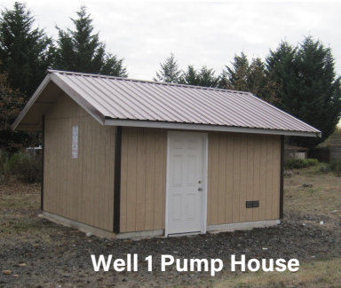
Well 1 Pump House

At the end of the year we applied through the Washington Sate Department of Health State Revolving Fund for the design and construction of consolidating Woodland Manor, Springwood, Cherry Park, Island Lake Manor, and Lakewood water systems. Along with treatment to remove PFAS and Nitrates. We will find out early next year if we will receive funding.