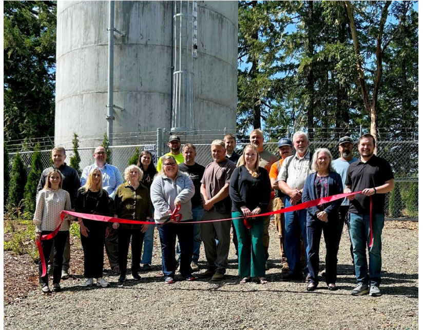
Ribbon Cutting at Vuecrest Water System in Union

POTLATCH, WA- Mason County PUD No. 1 recently hosted a ribbon cutting to celebrate the completion of their water construction project in the Vuecrest neighborhood of Union. The PUD's Vuecrest system was one of several systems that had longstanding wait lists for connections due to system constraints on mainline and water storage capacity. Thanks to federal funding that became available in recent years through the American Rescue Plan Act (ARPA), the PUD was able to partner with Mason County, the Washington State Department of Health, and the 35 th District representatives to piece together funding packages to construct these projects that sat on the PUD's Capital Improvement Plan for years.