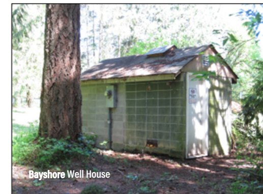
Bayshore Well House