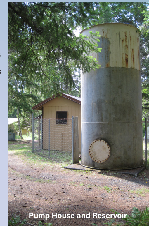
Pump House and Reservoir

To ensure that tap water is safe to drink, the Washington State Board of Health and/or EPA