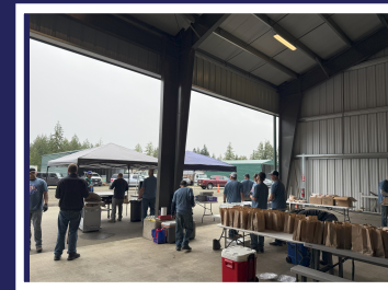
Customer receiving lunch at our Customer Appreciation 2025