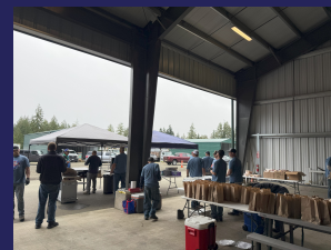
Customer Appreciation 2025